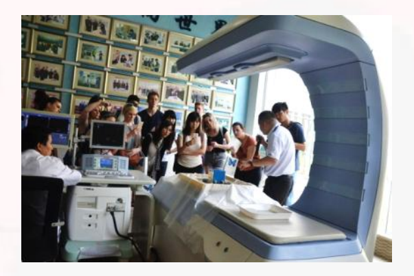
National Engineering Research Centre